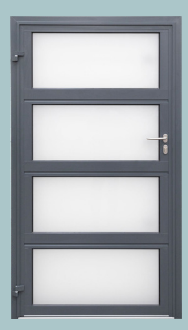
Matching side doors available.

Selecting the section colour and glazing type creates your door.